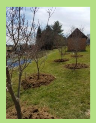
Trees installed at Montgomery Hall Park, above.

Right, dogwood being planted at Virginia School for the Deaf and Blind.